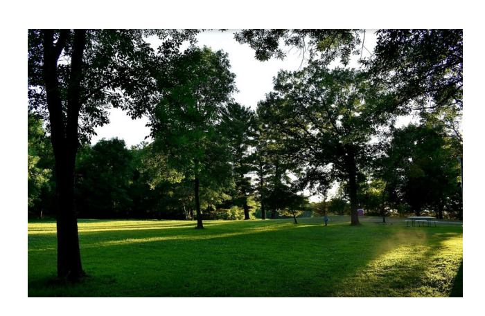
Serving our members since 1961

The campground is available for use by WLEOA members and their guests. Large groups who wish to use the facility should check in advance with a campground committee member. Phone numbers are listed in the Wisconsin Law Enforcement Journal as well as on the website at www.wleoa.com. Donations are accepted from campers and/or visitors to help maintain the grounds. The WLEOA believes our campground plays an important role in the positive physical and mental development of our young people as well as providing a relaxing haven for WLEOA members and their families.